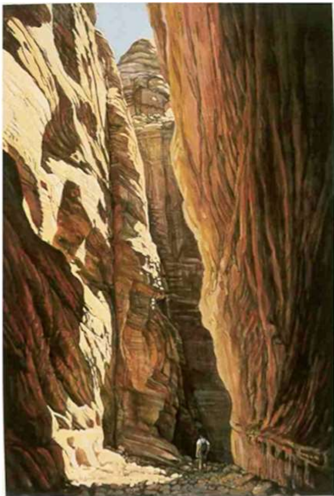
Peter Holbrook "Buckskin Gulch" 1994 18"x 27" Oil/Acrylic/Paper